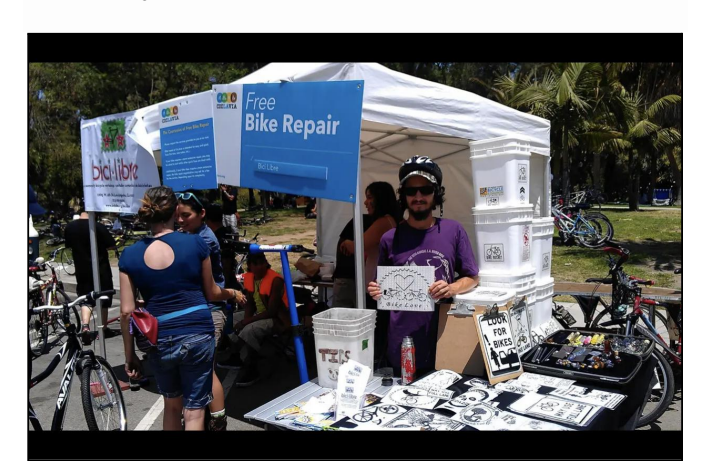
Bici Libre 10 years ago at CicLAvia

Many miles of open streets call for many bike repairs! Special thanks to Bici Libre, Bike Oven, Bicycle Kitchen, Hollydale Cycling Club, and Pedal Movement, for providing free basic bike repair services throughout the route to keep everyone riding smoothly.