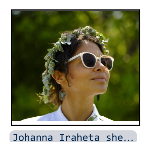
Role CEO Focus area KARMA Roots in Motion